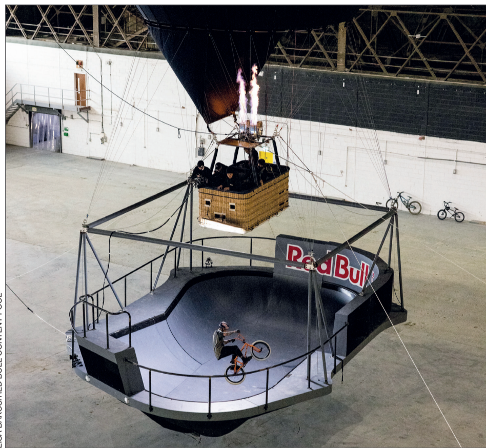
Kriss Kyle practising an "ice pick" in the specially designed BMX bowl. The bowl is designed to be compact and aerodynamic . It is made with the same materials as a Formula One car and weighs 1.7 tonnes.