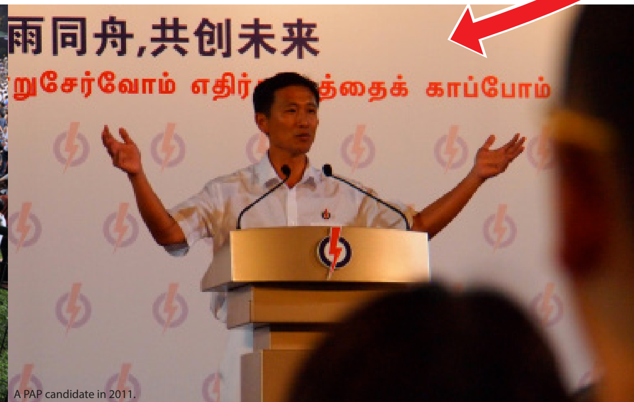
A PAP candidate in 2011.