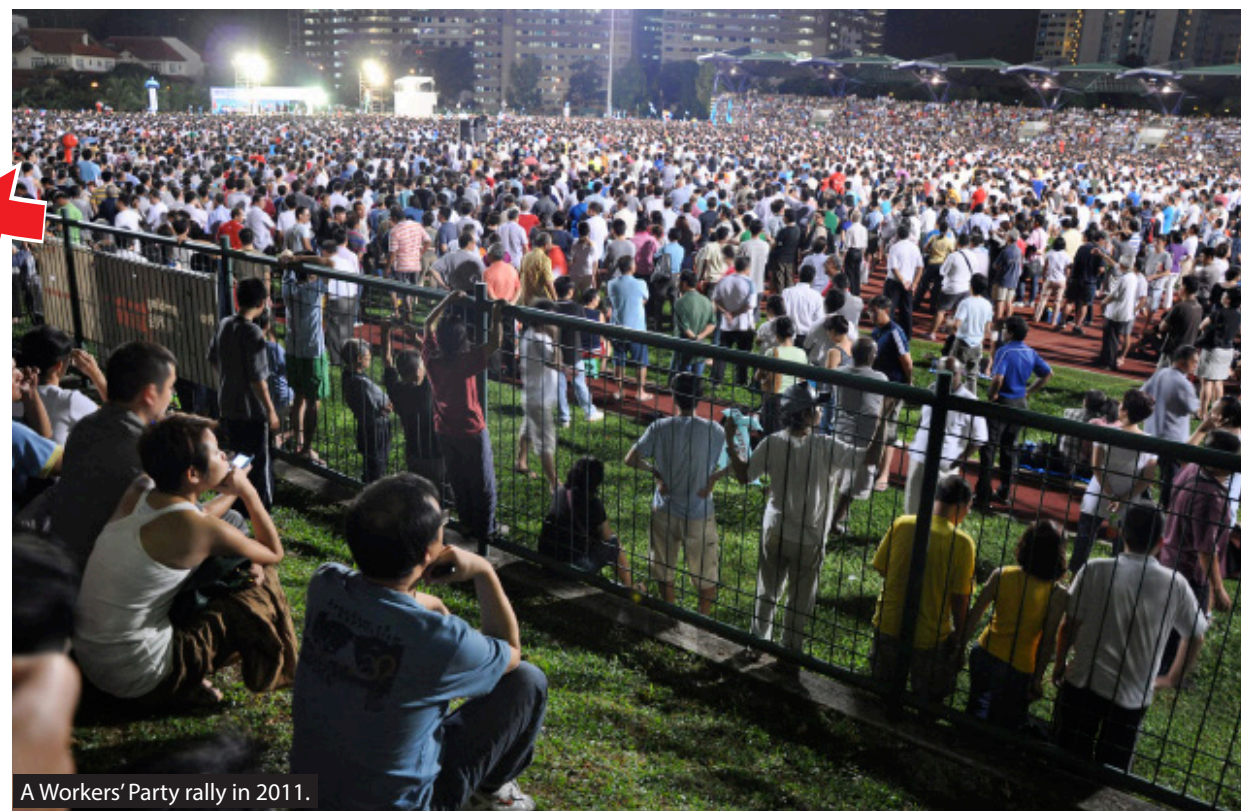
A Workers' Party rally in 2011.

In a stable democracy, elections are a never-ending cycle. When they are conducted peacefully and respectfully, and when voters choose wisely, everyone ends up winning.